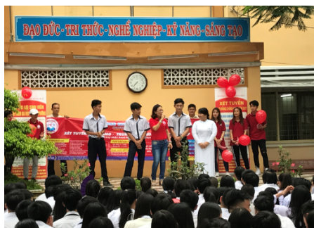
A staff of HVCT Admission Office exchanged information about HVCT with the pupils.

In addition to high school and secondary teachers, their pupils are the main target group that are in need of information about vocational training, so that they are aware that vocational training at college or intermediate level is also one of the promising options for their future career. With that goal, on the morning of 02.10.2017, HVCT staff of the Admission Office and teachers organised an information session for 800 pupils of the surrounding districts, in order to provide information about the College's vocational training programmes.