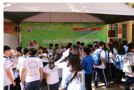
Many pupils visited the exhibition booth of the Department of Environment and Labour Protection.

IT, Fashion Design, Gastronomy, Pharmacy, Electronics, Mechanics, etc. During the workshop tours, they learnt about the occupations via playing interactive games, asked questions to HVCT staff and teachers to seek for information of vocational training at HVCT, participated in dialogues with successful HVCT alumni and company representatives. Moreover, HVCT also organised a career orientation centre to help the pupils explore their own strengths and weaknesses, thereby identifying suitable career paths for them. Additionally, the trainees who have recently graduated from HVCT were offered recruitment and start-up consultation with companies at the exhibition booths.