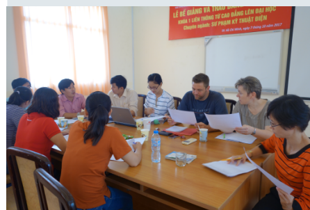
The training course for potential future examiners at HVCT from 09-11.10.2017

In order to achieve the demand-oriented training following the German standard, the examination and assessment also need to follow the German examination standard. Aiming to provide LILAMA 2 and HVCT teachers as well as in-company trainers from partner enterprises with the necessary knowledge, two training courses for examiners conducted by well-experienced German experts from IHK Dresden and Upper Bavaria/Munich were organised at HVCT from 09-11.10.2017 and at LILAMA 2 from 26-30.10.2017. After those trainings, the potential future examiners have gained an overview of fundamental preparatory steps, the usage of pre-selected instruments for upcoming final examinations, the fundamental principles of examinations in Germany as well as development and evaluation of the examination.