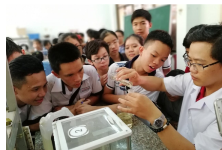
Pupils excitedly participated in a practice session at the workshop of Pharmacy at the event.

The Second Open Day on 25.11.2017 following the success of the first one added to a series of continuous efforts of the Field of Activity 3 to promote vocational training, contribute to increase the society's awareness about vocational training, engaging business sector in vocational training in order to enhance the quality and practice orientation, as well as ensure the trainees' employability./.