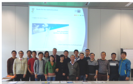
Participants visited the IHK Dresden.

Participants of the further course for the industrial electronics were 2 in-company trainers from partner companies (Viglacera Ceramics and Ishikawa Seiko) and 6 teaching staff from LILAMA 2 International Technology College. The 8 participants were trained on how to set-up and organise practical training based on German industrial standard. They also took part in the trial examination of industrial electronics oriented to the German standard. After finishing each part of the trial examination, the participants received feedback for their performances from the German examiners.