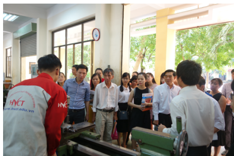
The teachers attentively observed and listened to a representative of the Faculty of Mechanics introducing about the Faculty's teaching and learning at the event on 01.10.2017.

On 01.10.2017, 100 teachers of Thu Duc District and District 9 attended the seminar "Education - Career Guidance and Enrollment between HVCT, Secondary schools and Centres of Continuing Education". At the event, in addition to direct communication with leaders of HVCT on vocational training at the College, the roadmap as well as opportunities for advanced education and career development after vocational training, the teachers also visited the College's facilities for teaching and learning to visually understand the College's vocational training activities.